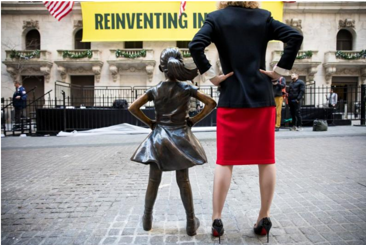
The "Fearless Girl" statue outside of the New York Stock Exchange.

The last all-male board in the S&P 500 has finally added a woman, marking the first time that all S&P 500 companies have at least one female director.