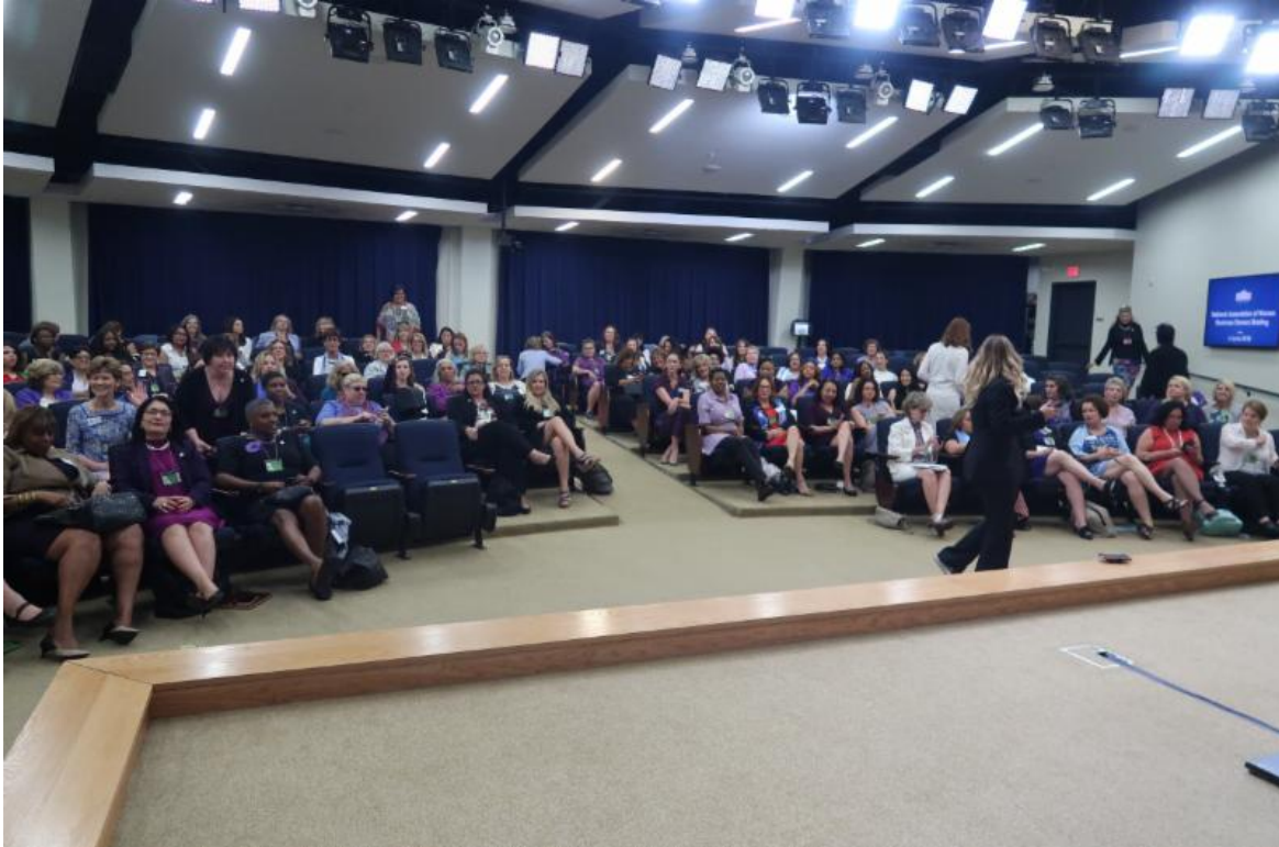
Members of NAWBO, a Vision 2020 Allied Organization, gathered for a White House briefing on June 4.